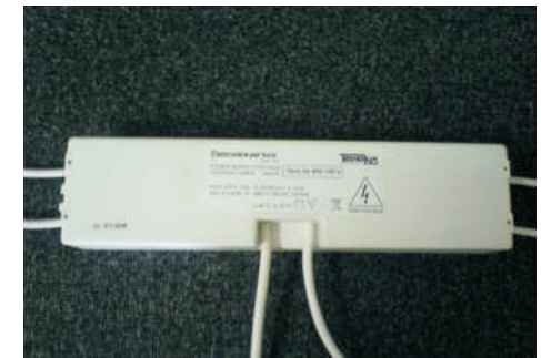
MAXI 100MA Low Voltage Electronic (Size : 37mm Ht X 245mm L X 60mm W) 0 ~ 10V Dimming max. 40 watts per mtr C-Cathode length (1 electronic transformer to beam up 2 lamps)