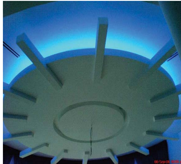
Indirect Cove illuminations