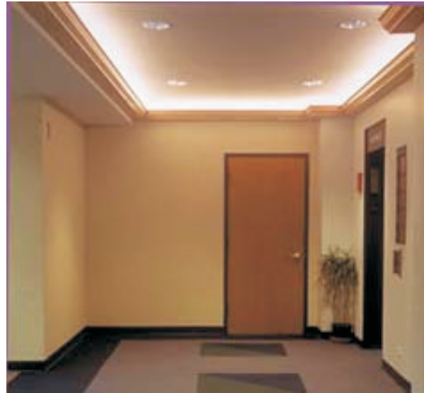
Indirect Cove illuminations