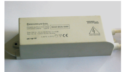
MAXI 2.5kv~100MA (Italy) Electronic Transformer (Size : 46mm Ht X 178mm L X 59mm W) 1 ~10V Dimming (Optional) 22watts per mtr C-Cathode length * Ceiling access NOT required.

Advantages : No flickering when switched ON, Clean and continuous light effect without dark spots, wide choice of colors including shades of white, can be shaped into any odd shapes & configurations, low consumption, Durable lighting system with optional Dimming (0-10V).