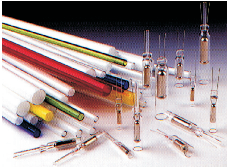
MASONLITE Cold Cathode™