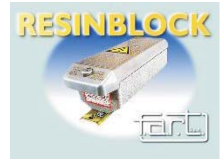
F.A.R.T (Italy) Transformer (Size : 100mm Ht X 280mm L X 95mm W) 39 watts per mtr C-Cathode length

* Ceiling access required for transformer