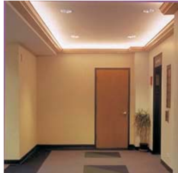
Indirect Cove illuminations