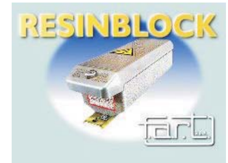
F.A.R.T (Italy) Transformer (Size : 133mm Ht X 295mm L X 113mm W) 49 watts per mtr C-Cathode length

*Ceiling access required for transformer