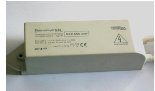
MASONLITE (UK) tubes & electrodes