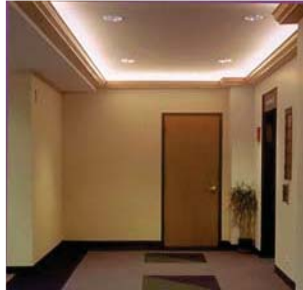
Indirect Cove illuminations