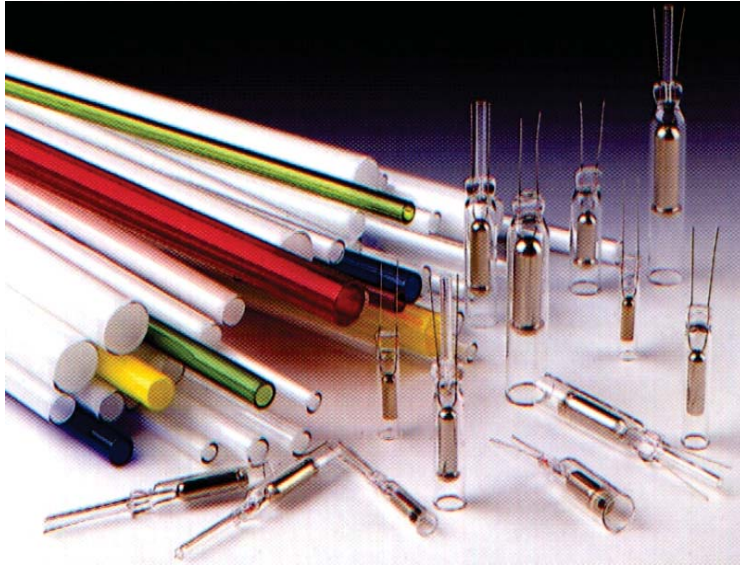
Masonlite Cold Cathode™