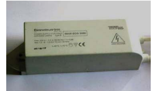
MAXI 3080 (Italy) Electronic Transformer (Size : 46mm Ht X 178mm L X 59mm W) 20watts per mtr C-Cathode length IP 65 rated