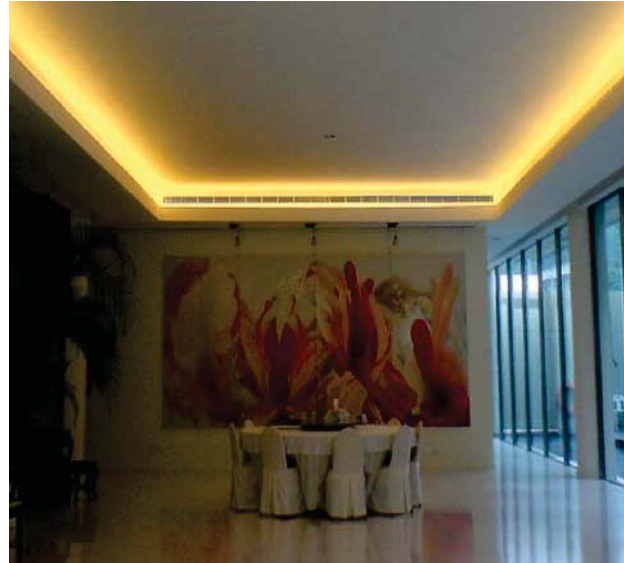
Indirect Cove illuminations