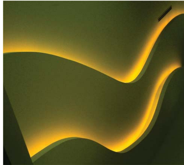
Indirect Cove illuminations