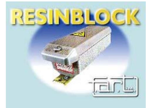
F.A.R.T (Italy) Transformer (Size : 145m Ht X 295mm L X 113mm W) 42 watts per mtr C-Cathode length

* Ceiling access required for transformer