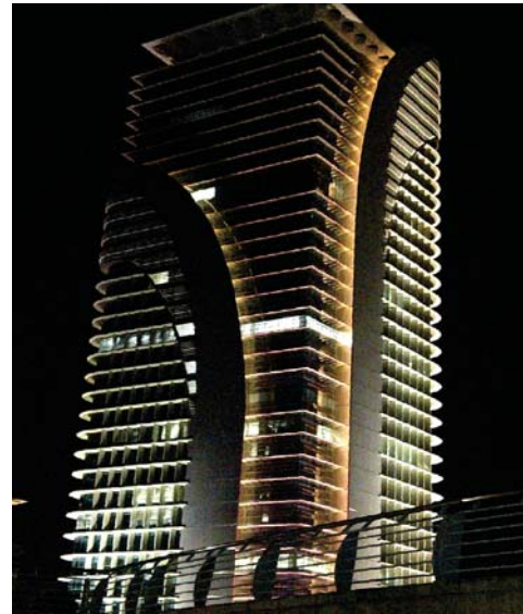
Direct Light Markers